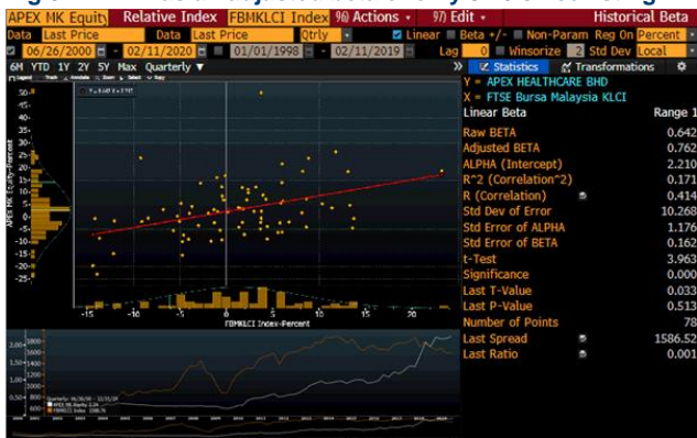
Fig 6: APEX has an adjusted beta of only 0.76 since listing

Fig 7: YSP has an adjusted beta of only 0.70 since listing