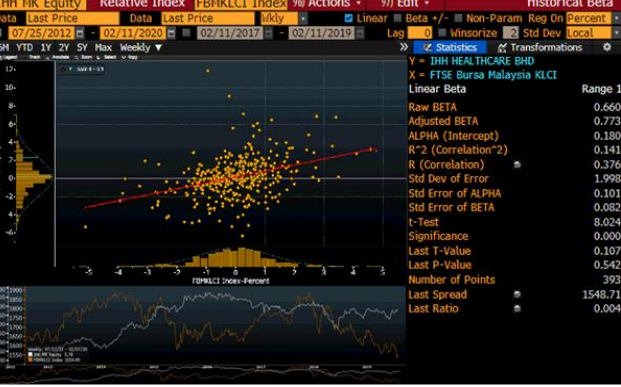
Fig 4: IHH has an adjusted beta of only 0.77 since listing