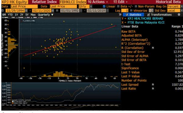
Fig 5: KPJ has an adjusted beta of only 0.83 since listing